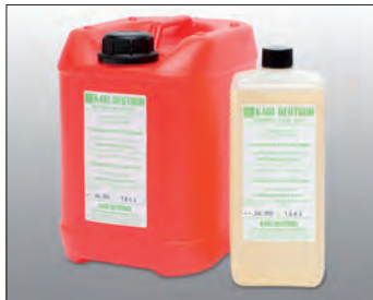
Package examples for ECHOKOR