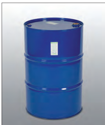
If large quantities are needed ECHOKOR and ECHOKOR LF are also available in 200 l barrels.

Water is an ideal couplant, however, it causes corrosion of test objects and test equipment.