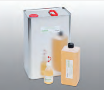
ECHOFLUID is especially suited for higher test frequencies and for wall thickness measurement

The couplant ECHOTRACE is a water-based gel with ideal ultrasonic properties and achieves better acoustic coupling compared to e.g. oil, grease or water. It contains anticorrosives, is dermatologically neutral and non-inflammable.