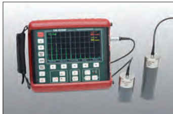
Adjusting standards with echo sequences of 50 mm and 100 mm