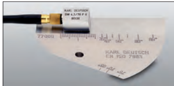
Calibration block no. 2

The calibration blocks are indispensable for the adjustment and check of ultrasonic instruments: