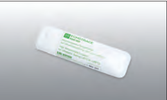
ECHOTRACE high temperature couplant for the inspection on hot surfaces