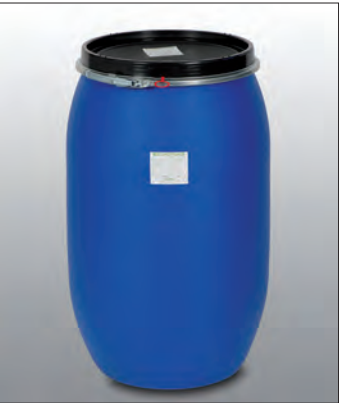
For large quantities barrels of 200 l are provided