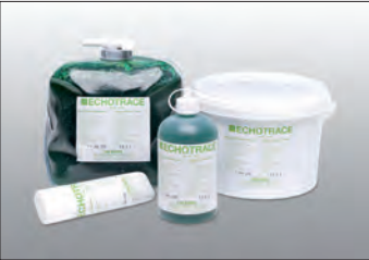
Various package sizes for ECHOTRACE: Indispensable for manual contact testing