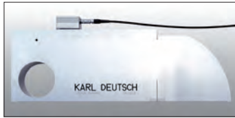
Calibration block no. 1