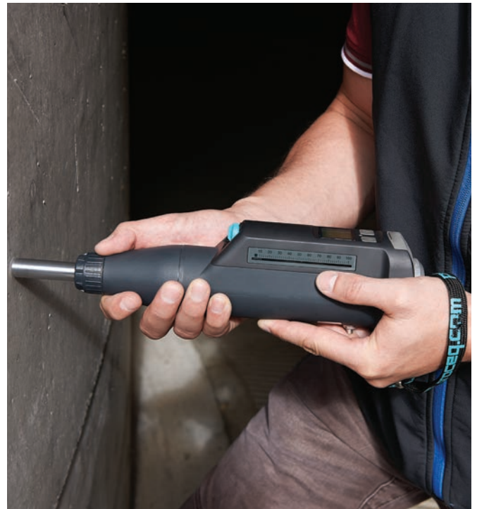
Original Schmidt Live with wristband

When acquiring a new instrument, max. 3 additional warranty years can be purchased for the electronic portion of the instrument. The additional warranty must be requested at time of purchase or within 90 days of purchase.