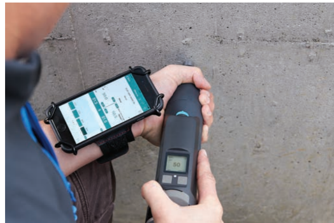
Original Schmidt Live with iOS app