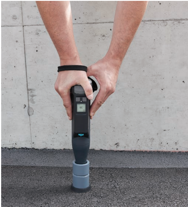
Original Schmidt Live with portable testing anvil