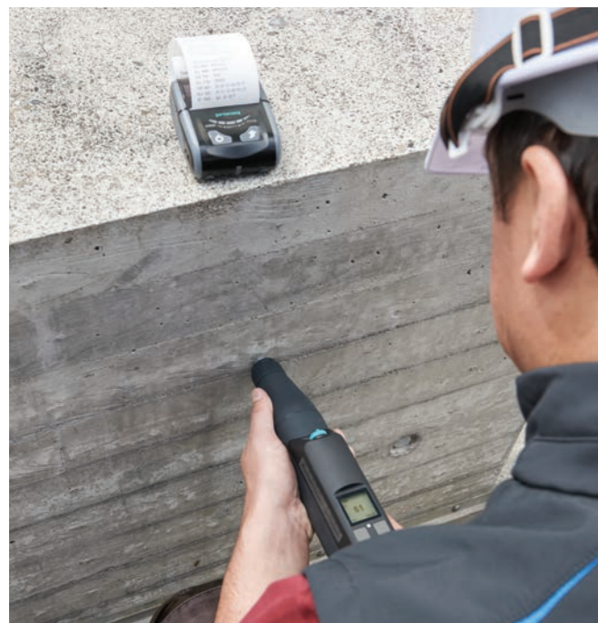
Original Schmidt Live Print with Bluetooth printer