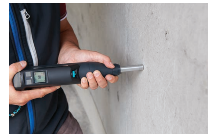
Original Schmidt Live with digital display